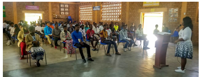
Inhaminga Bible School

Our Bible Schools remain the greatest focus of this ministry, for here is where our vision is both fulfilled and maintained. “Afrika Wa Yesu exists to win souls, make disciples, train leaders, plant churches that will win souls, make disciples, train leaders....”