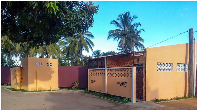
New bathrooms at Nampula wa Yesu

turned into a bigger operation than we thought. We are very pleased with the new toilets and they look so smart. Nampula Church, you have done an amazing work upgrading your property.