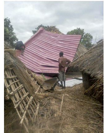
The roof at Chiluvo wa Yesu blew off in a storm, it has since been repaired.

Pomene Church was built last year but still has no roof. We will try and get there as soon as possible to put on a roof.