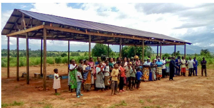
Mauza Wa Yesu (Milange)

In the Milange area, two AWY churches that were very close together, came together as one. Because the members did not fit in either small church, we were asked to build a shelter at Milange about 14km from Milange town. Again, the Nacala team went to Milange and built a shelter.