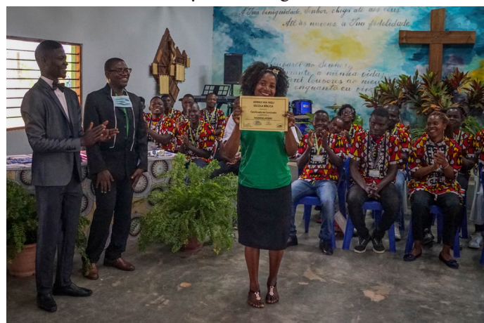
It's a big achievement to graduate from the correspondence course.