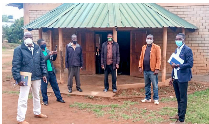
Gorongosa wa Yesu