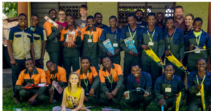
Electrics and Carpentry Classes of 2021

Woodshop: The woodshop continues to trundle along with enough orders to keep the business going. We have had a few good orders in but with the covid problems we have been facing, a lot of people have stopped building because of funds and this has affected the work we do. We have not stopped looking for work and have been exploring different avenues, eg, pallets, packing boxes etc. We have also started to work with an education business that supplies