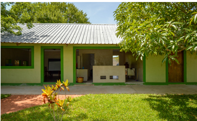
Nacala Kitchen and Cafeteria