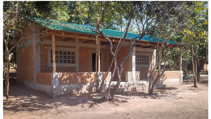
Guest house in Inhaminga - come visit!

We have completed a duplex guest house, consisting of bedroom, bathroom and veranda for guests. A very nice building. Thanks to Alberto Gravata who has done such a good job in overseeing the project together with our team and his temporary builders. The clinic has been disassembled and everything is in storage. This is now accommodation also for visitors. So that's 3 apartments of visitors. Each has a double bed and a bunk bed.