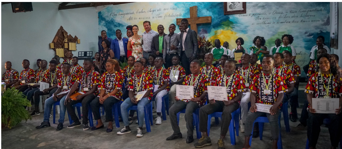
Faculty and students at Nacala Graduation, 2021