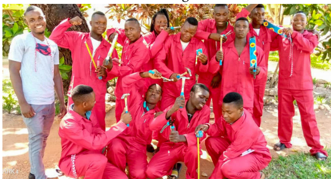
Electrics Class of 2020