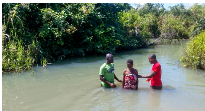
Baptisms on evangelism - growing the Kingdom of God

EVANGELISM: Large gatherings and crusades have not been possible. However, small group evangelism has brought a great result. Everywhere people have received visits of encouragement with great joy. Student evangelism brought in testimonies of hundreds of people receiving Jesus, healing, deliverance from demons. We give thanks to God!