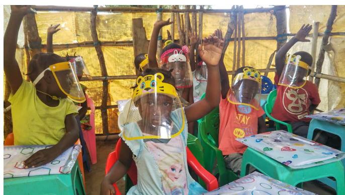
Teaching preschool in shelter's in the parent's yards during shutdown.

We did general cleaning in the precinct of the school and washed the walls of the classrooms that were very dirty. We also washed the kitchen walls. And we cleaned up the toilets, and replaced the broken faucets.