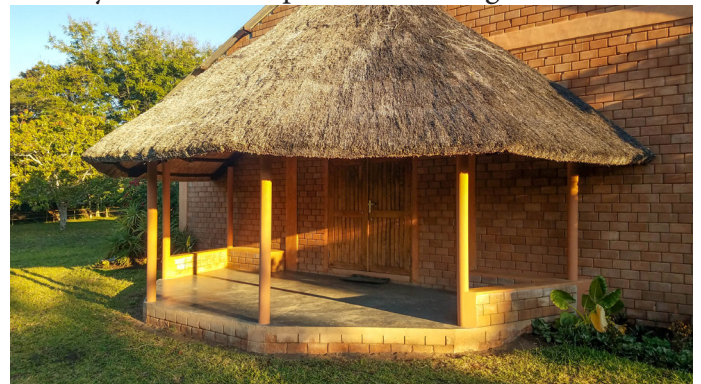
External seating at Inhaminga Conference Centre

We helped Nampula Church with the upgrade of their toilet system. Due to previous workings in the area, it