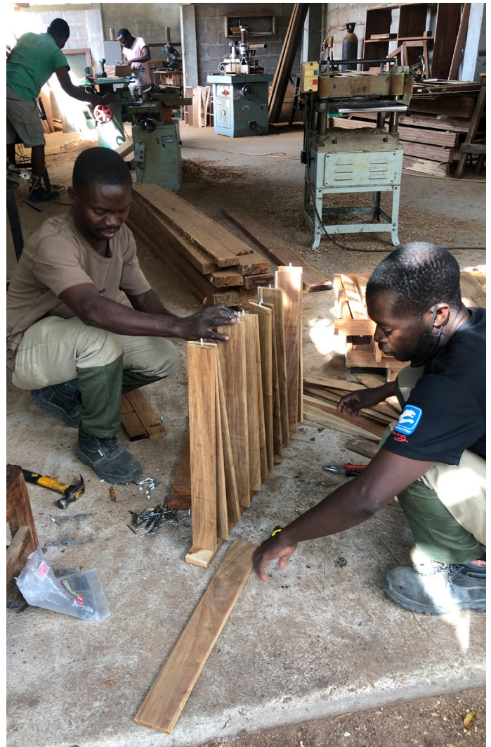
Assembling louvred windows in the woodshop