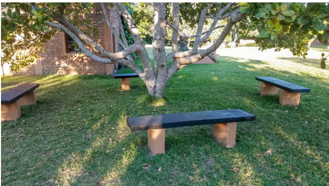
Student outdoor areas

Inhaminga has made cement seating and tables. It's become a good social point and a place to play games in off time. Around the hall there is now seating on the outside, so those who need to be outside can still be part of the service.