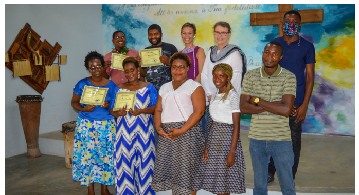
Afrika Wa Yesu Team with the Trauma Training Team from Pemba