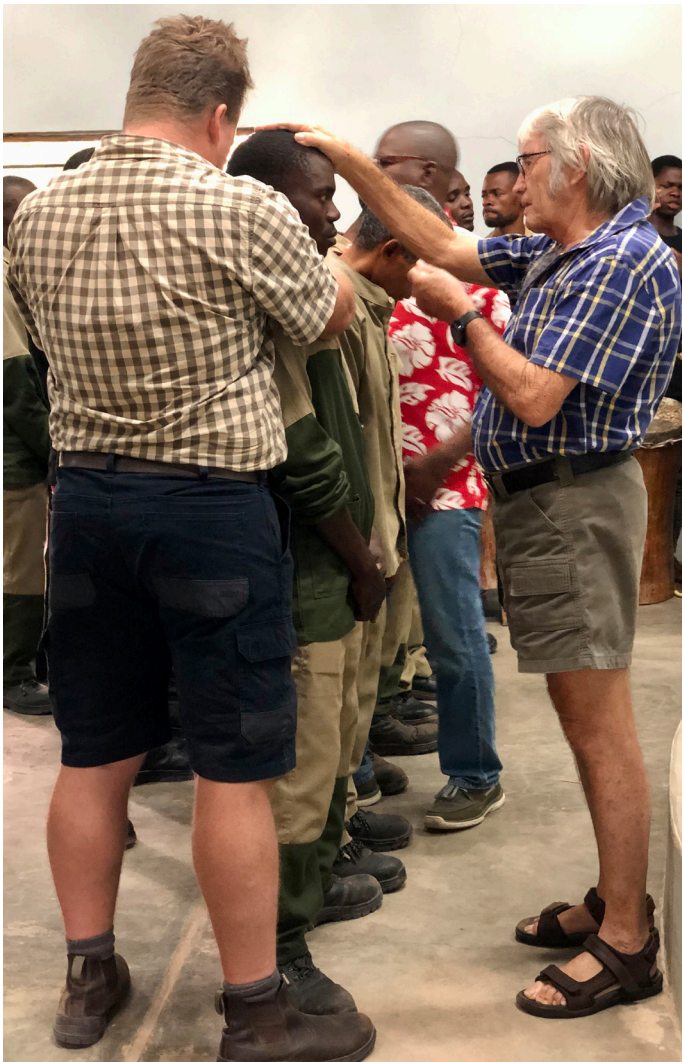
Blessing workers during morning devotions

Change in workers' personal lives: we know that in the past there were problems with theft caused by workers, in the conversations we always had I found out that many of our workers were in debt, and many of them had no wages because their bank cards were in the hands of other people they owed; we appealed to them to pay off debts and we thought about creating a savings bank, so that everyone could save for when the person is distressed to use the money in the bank. this is working and is helping a lot, so far we