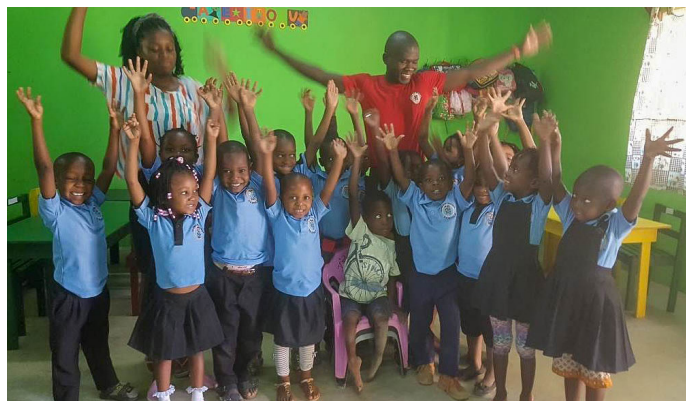
Children and teachers happy to have Kids Clubs open.

CHILDREN'S MINISTRY: Children are always open to the gospel. Their faith is amazing and they are ever the future of the harvest field.