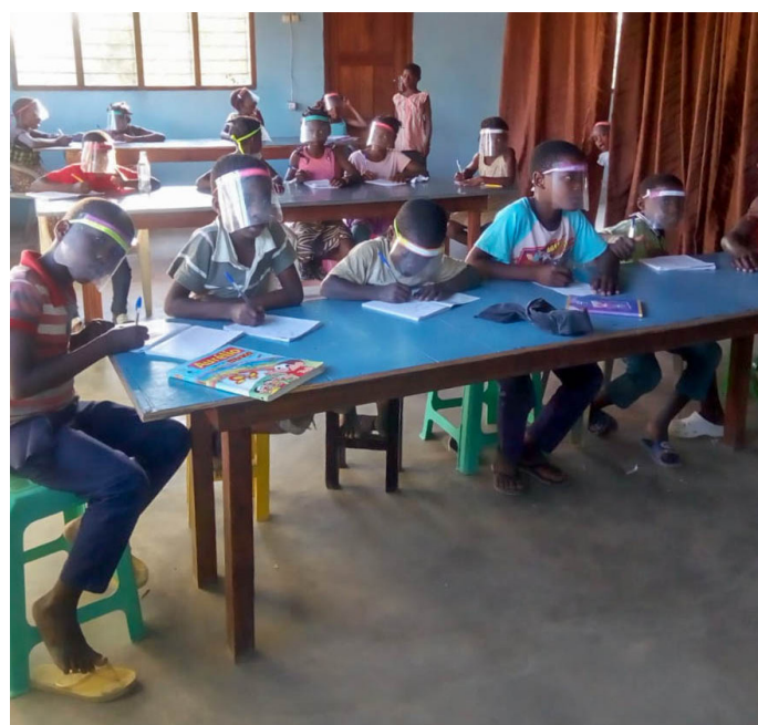
After school extra study help for the older kids

On June 28th we started classes. In the beginning not a lot of children came, but we always received new participation, and we received parents and guardians who came to register their children. We now have a total of 42 children, where 12 are from KG1, 17 are from KG2 and 13 from school support. All the staff who work at the kindergarten were very happy and excited about the children and the classes, and the children were doing really well and loving to participate in the classes. In conversations with some guardians of education, I could see satisfaction with