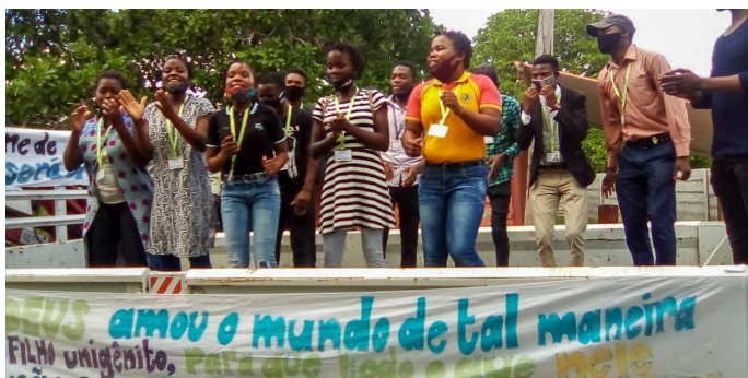
Celebrating Easter with a drive through the city

but could not walk where there was water. The students prayed for her and received her healing and immediately got up and walked alone to the baptism site. She saw the hand of God. And she believed the existence of Jesus, because of this testimony of hers, she made the other believers stronger.