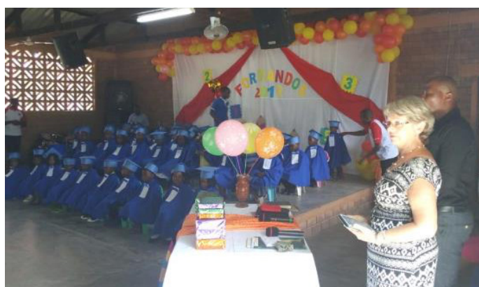
Kids Club Graduation - Inhaminga