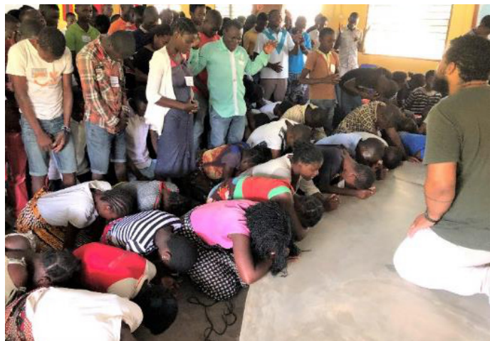
Youth Conference, Nacala

to reach the youth with the love of God. For sure, we treasure every youth meeting, seminar, conference or crusade we had. And how much we miss that time!