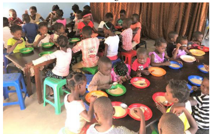
Kids Club - Nacala Wa Yesu