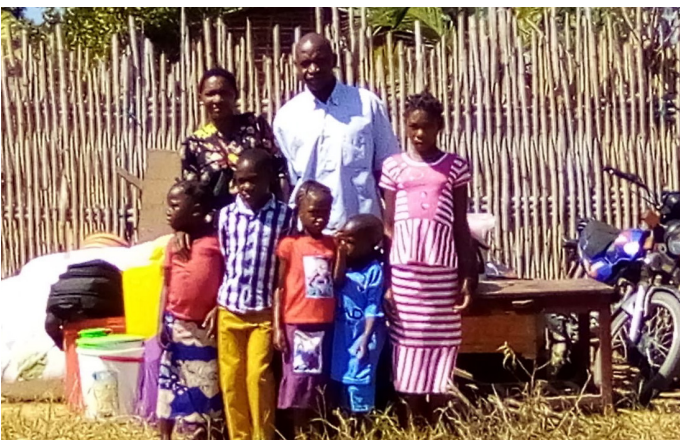
Mudança de uma família pastoral do norte para um local mais seguro.

carry great testimonies of God's miracle working power in action as students and teachers have gone on specific mission outreaches. Each ministry department has its own missions success that can be read in their submitted reports. While we continue to establish and secure our churches, we continued till the end of November with crusades throughout the nation. A great harvest has come in through these gatherings.