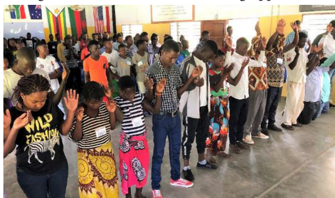
Receiving Jesus into their hearts.

How grateful we are for these amazing opportunities