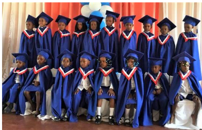
Kids Club Graduation - Nampula