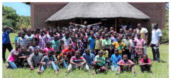
Kids Camp - Inhaminga