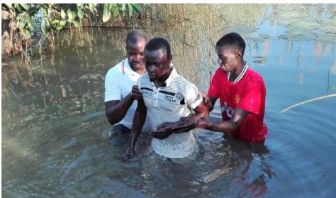
Milange Youth Conference

and all the team of the Children's and Youth Department of Afrika Wa Yesu