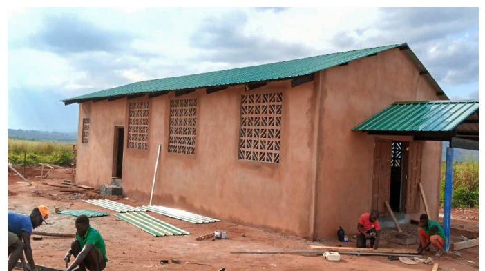
Milange Wa Yesu