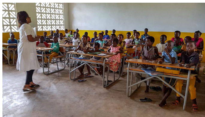
Teaching in the classroom at the Escola Aerodromo

facilities. It is on a big property with plenty of trees. The kids soccer field is a fun place for the whole community. Most of the area was planted to a hardy grass. This is a government school run by government teachers, a gift from Afrika Wa Yesu to the community.