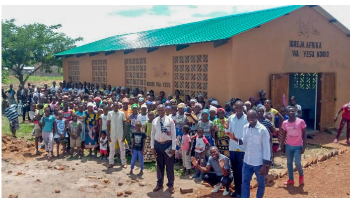
Ndoro Wa Yesu