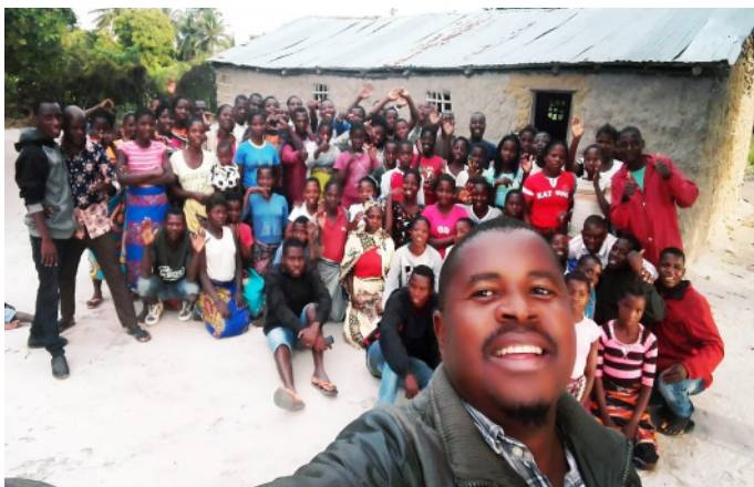
Munhonha Youth Conference