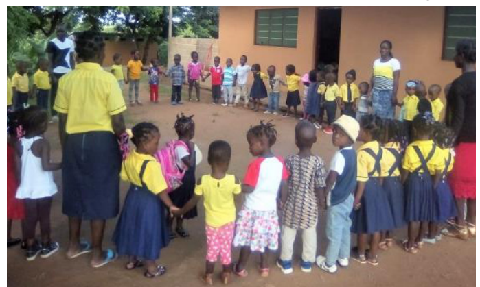
Kids Club - Gorongosa Wa Yesu