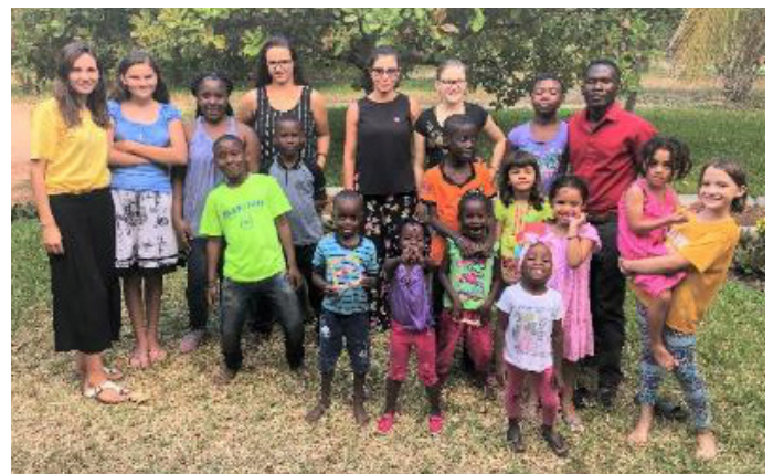
Afrika Wa Yesu Team Children's Conference