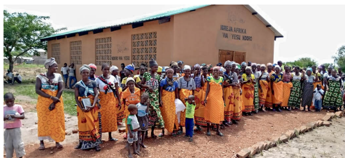
Igreja Ndoro wa Yesu

Ndoro Church: The Inhaminga building team completed the Church and built good pit toilets.