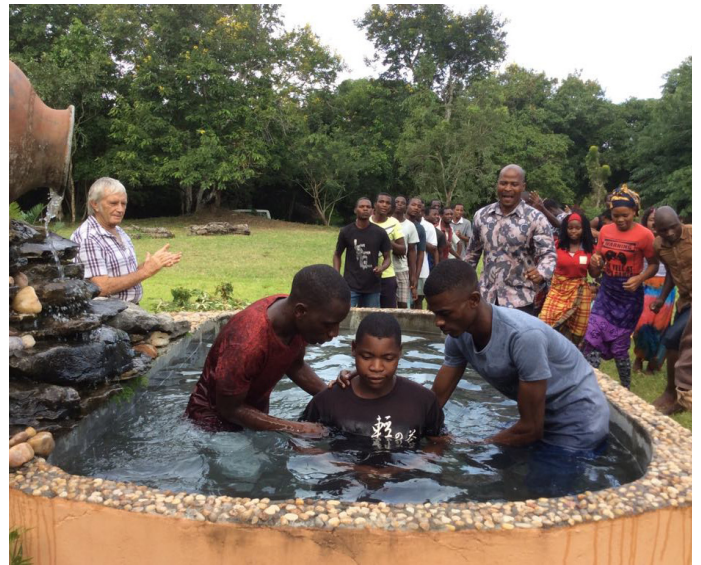
Batismo nas águas e com o Espírito Santo ~ Formação Espiritual em Inhaminga.

experiences in the lives of students as well as in our lives. For this year we had introduced gymnastics as part of our morning moments according to what we had learned at the time of our apostolic conference on good health, it was a lot of fun and healthy at the same time, we ended up adopting it as part of our curriculum because we felt that this was missing. We thank God that we have always received help from other team members during our semesters, that this has somehow encouraged us a lot and also the students themselves to understand how we work in a family.