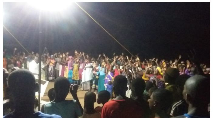
Campanhas de Evangelismo e Cura nas províncias centrais

These events continued into the middle of March, 2020.