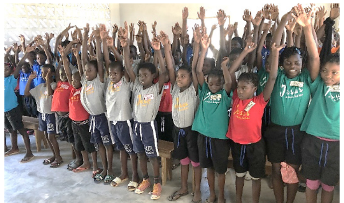
Kids Camp - Racine

In February 2020, 689 children enrolled in our programs at Kids Clubs. The number of children has been increasing and we were more than excited to see them grow knowing Jesus and opening their minds to knowledge. But in the last 4 months, everything has been changed through the pandemic lockdown. Schools shut down, and it breaks our hearts that they are still closed. After 2 weeks of lockdown we regrouped, communicating through emails, whatsapp and phone calls, and decided to use different strategies to still see the children. We took advantage in the first month of lockdown to do a lot of teacher training, organizing and disinfected everything at the facilities. We printed activities for children with instructions for