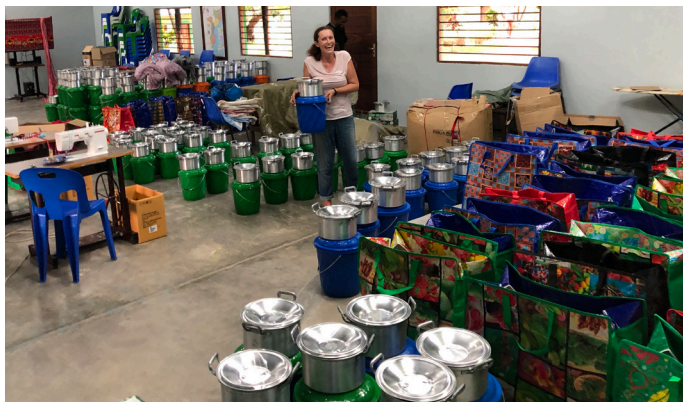
Preparando e distribuindo pacotes para famílias de refugiados