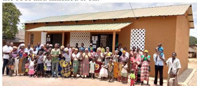
Igreja Salinas wa Yesu

Salinas Church: The Votec students were on a construction course so were able to put their new skills to test by building the Salinas Church. They did most of the construction then the Nacala team put on the roof and finished it off.