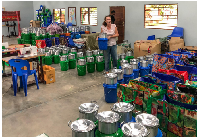
Preparing relief packs for displaced people in the north.

Financial Giving for Cabo Relief: We received $10,000.00 for relief in the north from Word of Life Church. This has been a tremendous blessing.